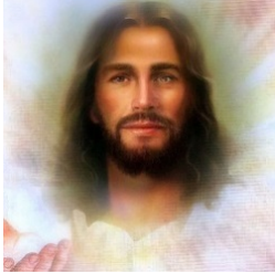
Jesus of Nazareth , now Master of the Celestial Heavens

These messages were received from Angels and Spirits who once lived on Earth.